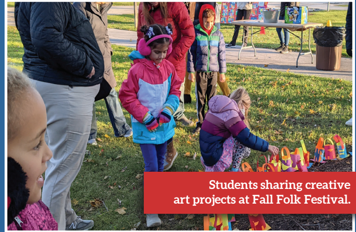
Students sharing creative art projects at Fall Folk Festival.

After the success of this year's art, guidance, makerspace, music, physical education, and Spanish collaborative festivals, we cannot wait to continue the tradition in future school years! The joy and sense of community that is created during these special events is what learning and growing as a Stormonth student is all about.