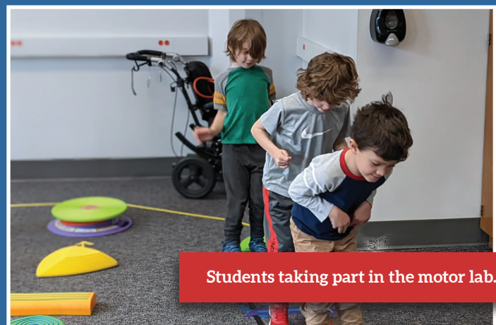
Students taking part in the motor lab.