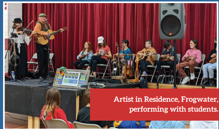
Artist in Residence, Frogwater, performing with students.

Bayside Forensics had a record total of nearly 30 participants this year and earned 30 medals throughout the six-week competition window.