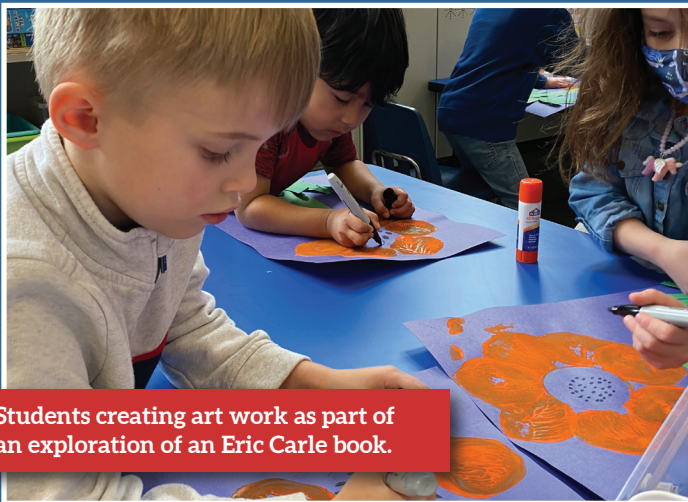
Students creating art work as part of an exploration of an Eric Carle book.

Similarly in math, students utilize hands-on Number Corner which includes problem solving around the calendar, and the Bridges Math curriculum, a highly differentiated and adaptable program that focuses on investigations in mathematics and critical thinking skills. Also gone are the days where everyone learned math in the same way. Instead, students are taught multiple techniques for problem solving and learn “why” mathematics function as it does.