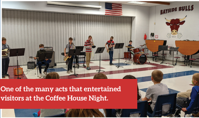
One of the many acts that entertained visitors at the Coffee House Night.