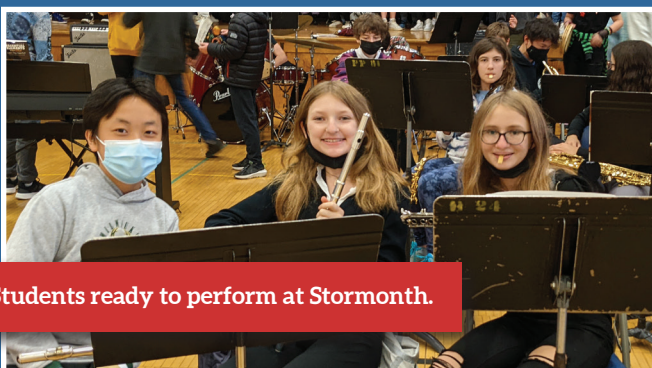
Students ready to perform at Stormonth.

The performance was more than just a nostalgic visit to our district elementary school: it gave third and fourth grade students information about what is possible in middle school. As they prepare to transition to fifth grade, fourth graders were encouraged to register for elective specials classes like band, choir and orchestra. Students then participated in instrumental trials the following week in which they held the instruments and heard them up close.