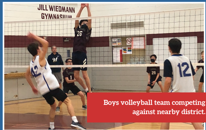
Boys volleyball team competing against nearby district.

Bayside Middle School is very proud to announce