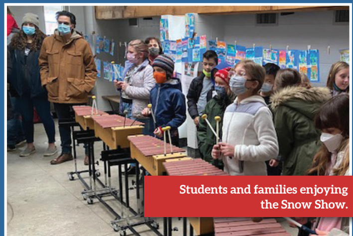
Students and families enjoying the Snow Show.