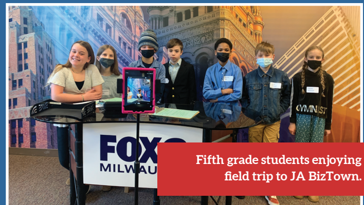
Fifth grade students enjoying field trip to JA BizTown.