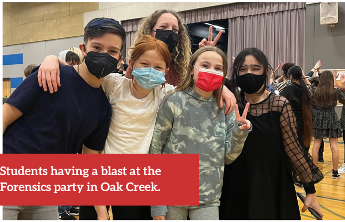
Students having a blast at the Forensics party in Oak Creek.

Highlights include a third place win at Oak Creek, a first place win at Whitefish Bay, and a tied second place win at Wisconsin Hills. Twenty-two participants made it to the State Meet, where we won a gold medal in poetry. The entire team showed tenacity, progress, and camaraderie throughout the season. The heart of Forensics is building confidence, persevering through obstacles, and using one's voice to make the world a better place.