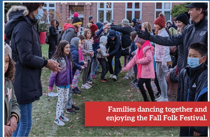
Families dancing together and enjoying the Fall Folk Festival.