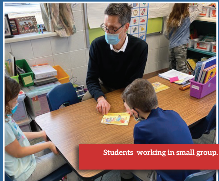
Students working in small group.

work to attract and maintain the most highly-trained teachers and support staff. Our teachers utilize methods that adjust to your child's specific needs. Long gone are the days when students were taught to read from a basal reader with everybody reading from the same textbook in a one-size-fits-all model (most likely the way you and I were taught to read). Instead, we teach reading with a mini-lesson addressing the large group, and then spend most of the lesson working in small groups and one-on-one to meet your child exactly where they are in reading, and push to move them forward.