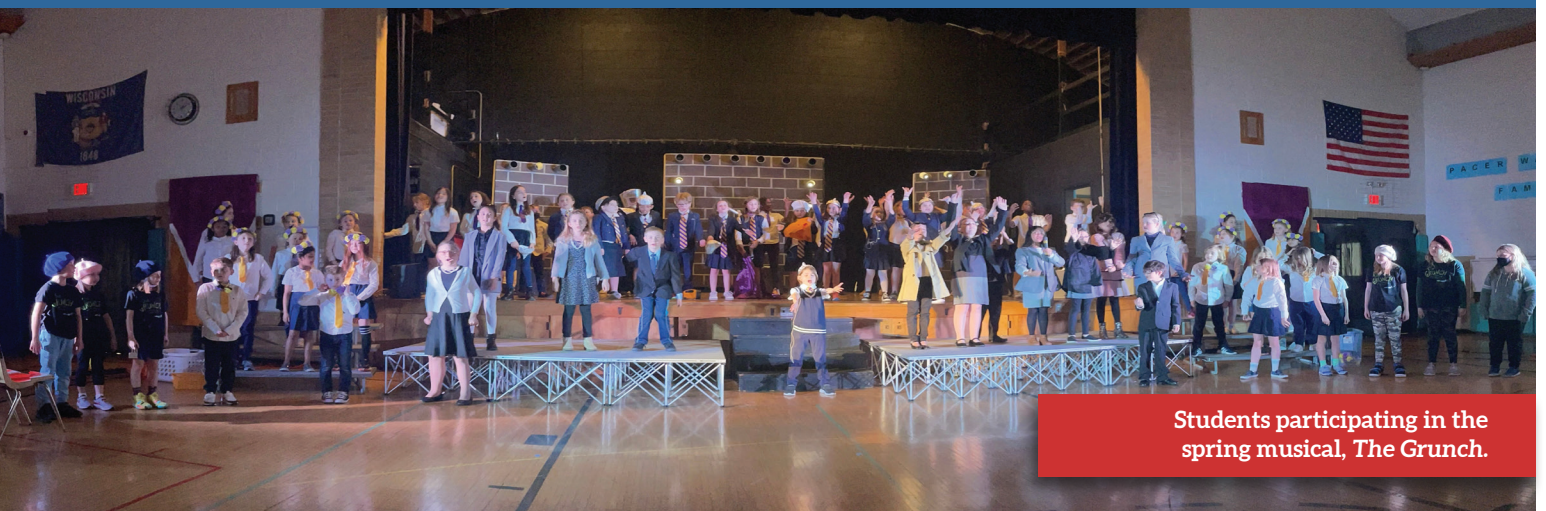
Students participating in the spring musical, The Grunch .